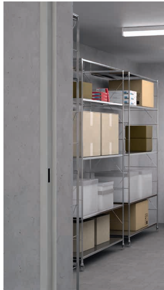
ECOPACK® LED generates pleasantly uniform light and achieves high visual comfort for many standard applications in buildings.