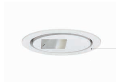
Lunis® LED micro wallwasher* | Lunis® LED mini wallwasher*