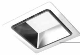
Lunis® LED micro square | Lunis® LED mini square