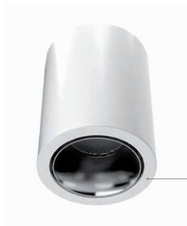
Lunis® LED micro round, surface* | Lunis® LED mini round, surface*