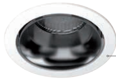
Lunis® LED micro round | Lunis® LED mini round