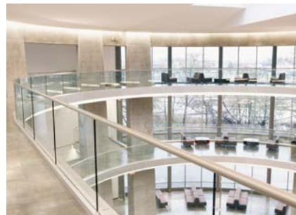
SDT: Perfectly uniform light for years